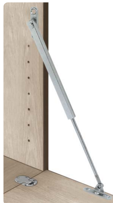
Flap hinges are shown on pages 85-86