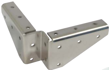
Corner brace item C, page 46

Table connecting fittings are shown in Section 7 pages 46-48