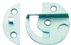
Table top connector item B, page 48