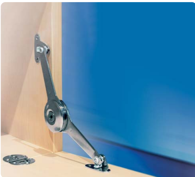
As flap stay with wooden flap