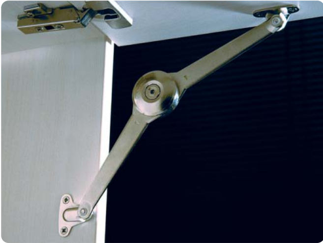
Wooden lid flap