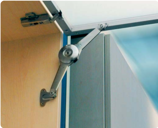
Lid flap with aluminium frame