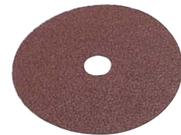
F Sanding disc