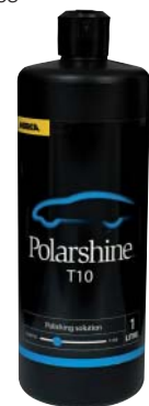
G Polarshine T10