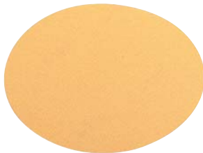
B Sanding disc, Ø 150 mm