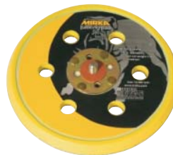
D Backing pad