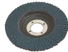
E Sanding disc, Ø 115 x 22 mm