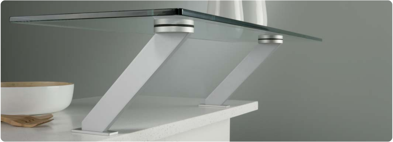
Photograph shows glass breakfast bar support, Cat. No. 505.14.976