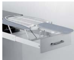
Optional sleeve arm available

Optional sleeve arm and replacement covers are available.